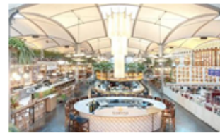
Nº 24 El Nacional Restaurant