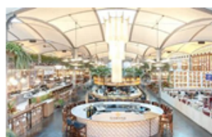
Nº 24 El Nacional Restaurant