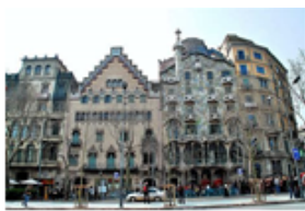
Nº 41-43 Casa Batlló i Amatller