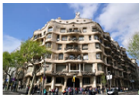
Nº 92 La Pedrera

Take a tour around and see the most famous Gaudi building!