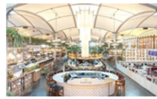
Nº 24 El Nacional Restaurant