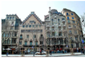
Nº 41-43 Casa Batlló i Amatller