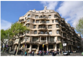
Nº 92 La Pedrera

Take a tour around and see the most famous Gaudi building!