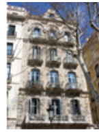
Nº 26 cookiteca